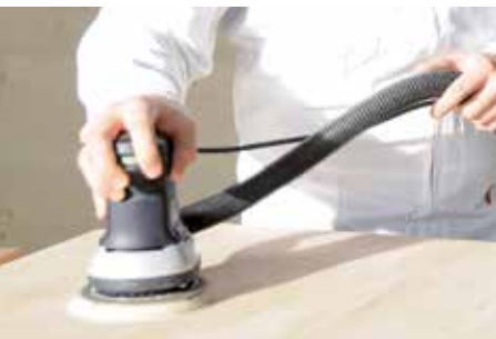
SAND DOWN SURFACES