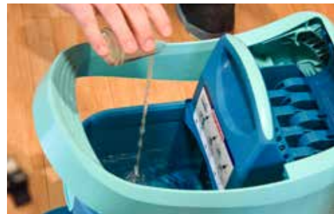
OBSERVE MIXING RATIO OF SOAP AND WATER