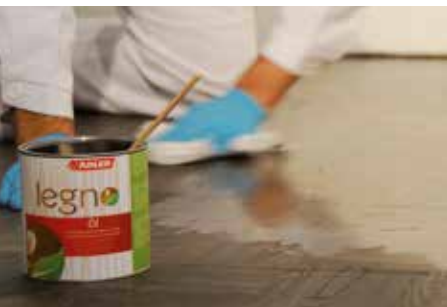
REPEAT PROCEDURE WITH LEGNO-ÖL OR LEGNO-HARTWACHSÖL