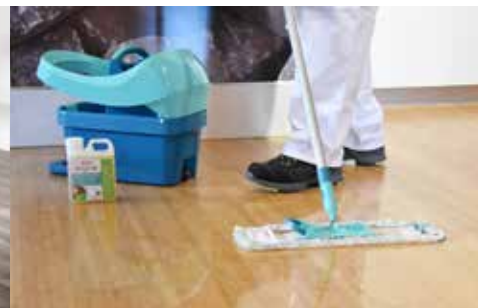
WIPE FLOOR WITH THE SOAPY WATER – DO NOT ALLOW ANY PUDDLES TO STAND!