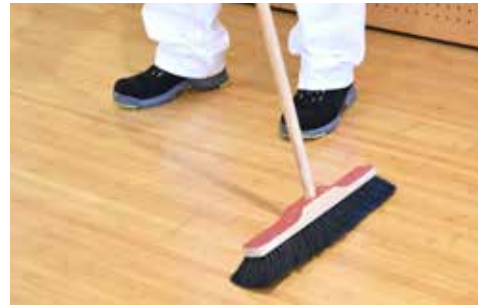
CLEAN THE FLOOR

Clean the floor roughly with a broom or vacuum cleaner. Clean the floor with clear water. Fill a bucket with fresh, lukewarm water. Shake the Legno-Holzbodenseife well and add to the water in a ratio of 1:100. Wipe the floor with the soapy water. Do not allow any puddles to stand. The floor can be walked on again once it has dried.