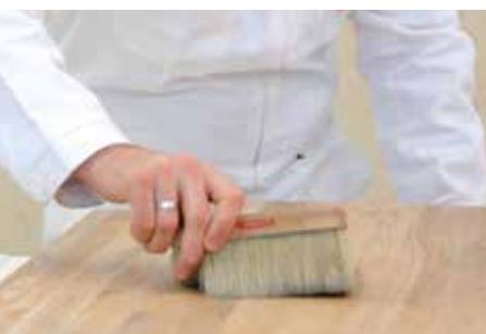
REMOVE DUST AND DIRT